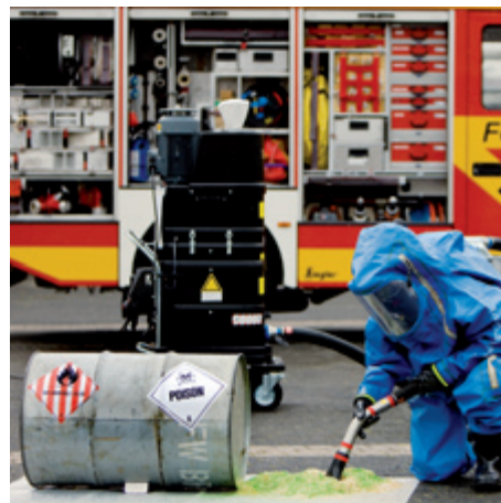
R01 R040 explosive gas for the fire brigade