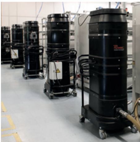
R01 R040 in circuit board manufacturing