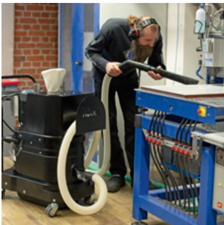
R01 R022 explosive dust in woodworking