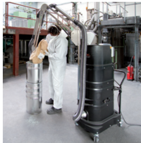
R01 R075 explosive dust, with extractor arm in the production of plastic