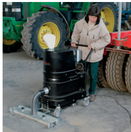
R01 R022 explosive dust with floor vacuuming device in the agricultural industry