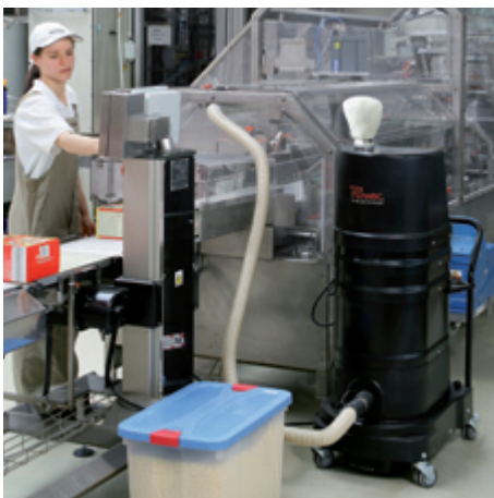
R01 R022 explosive dust in food production